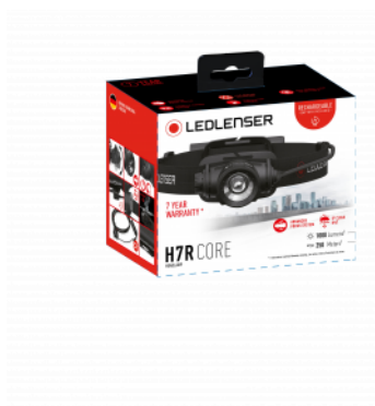
Exemplary Packaging Illustration